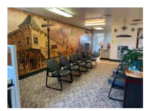
ICHC's new waiting room and reception area.