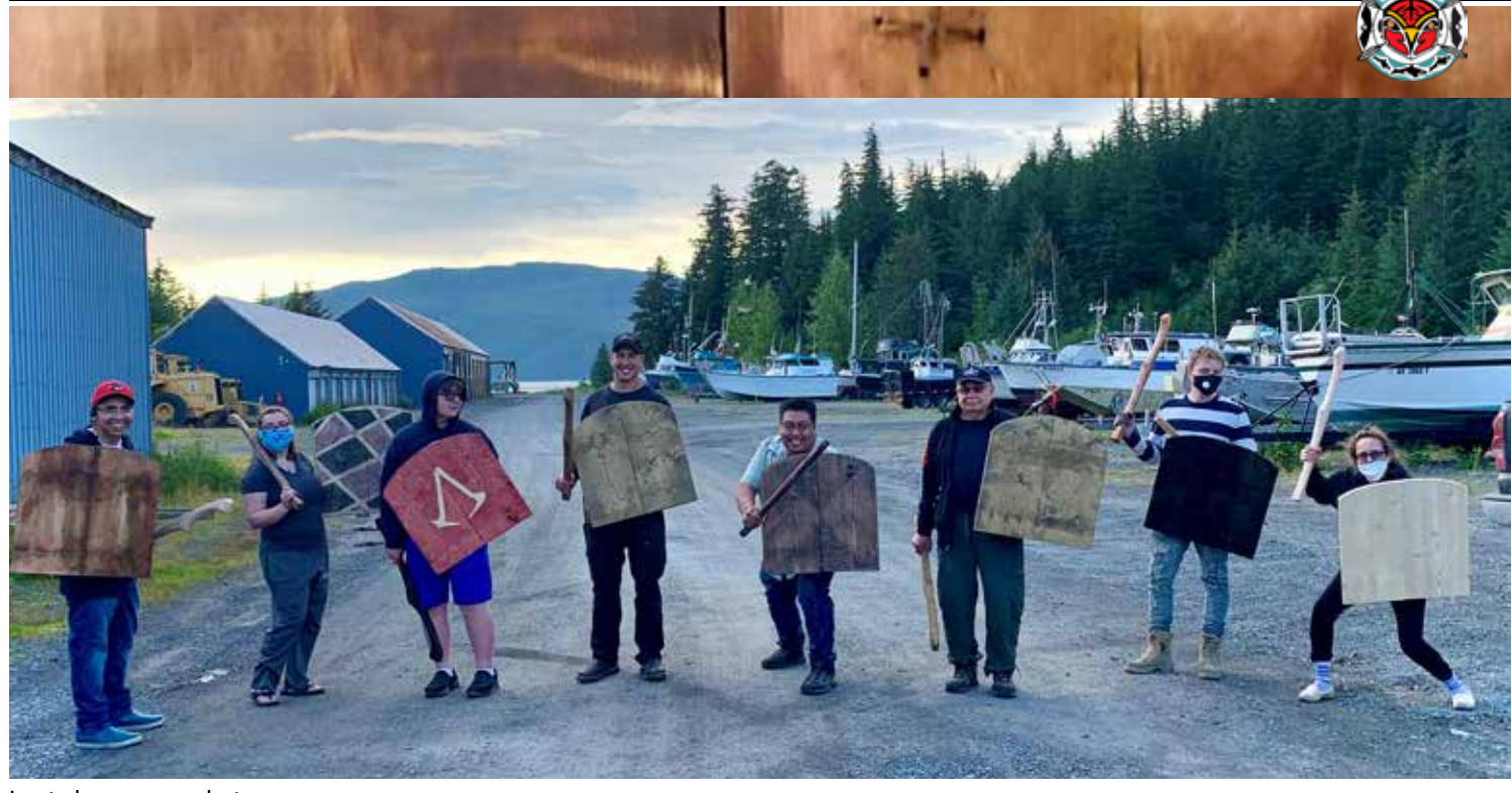
Last class group photo.