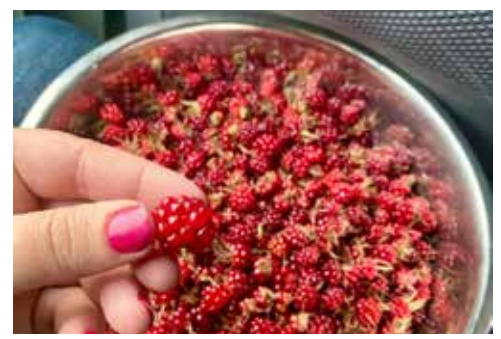
Savannah Eike's successful nagoonberry (ts'AXLiqaatl') harvest.