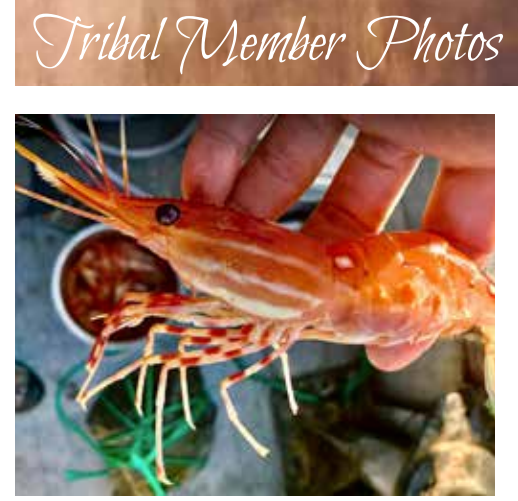
Monster Prince William Sound spot prawns.