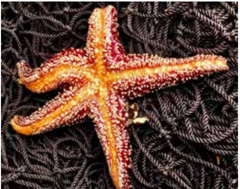
A stray sea star gives a pop of color against dark fish net (dzAwuL).