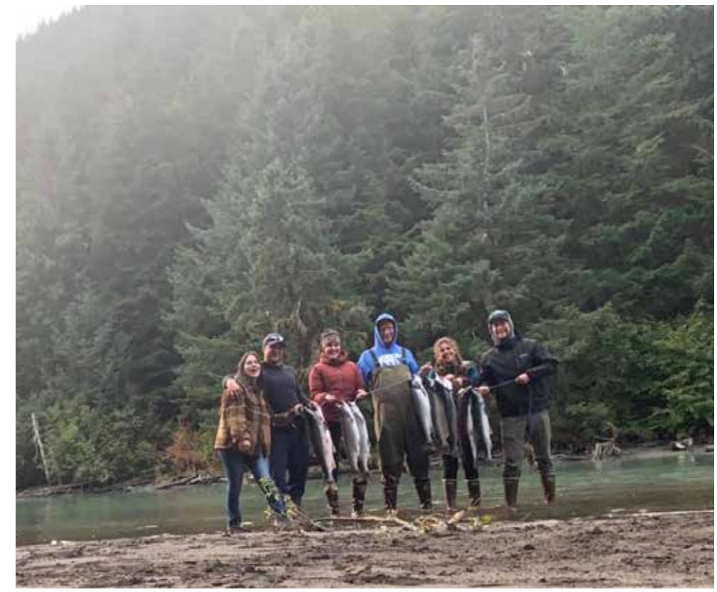
Great day down Eyak River catching silver salmon (AdAte'ya').