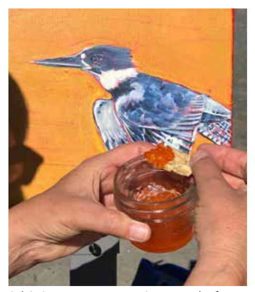
Sylvia Lange pauses to enjoy a snack of salmon roe (q'Amaa).