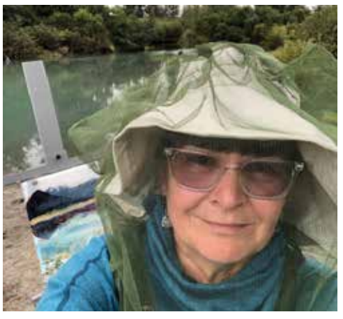
Painting at 22 Mile in the summer is more enjoyable with a bug net.