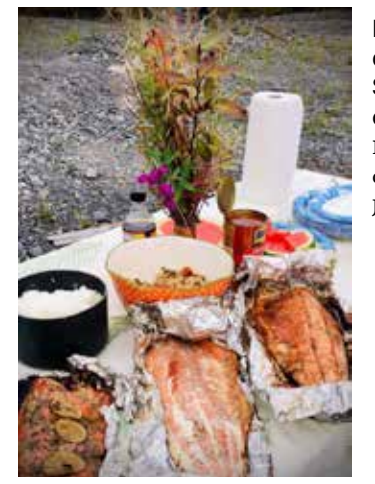
Picnic dinner out Sheridan on Sept. 6.